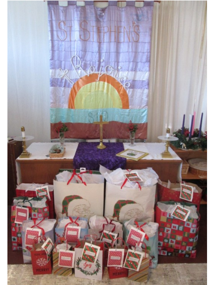
Gifts from St. Stephen's to Operation Santa for kids served by local Social Service Organizations

Wish lists were received for 15 children served by Operation Santa and 14 kids served by CAPSLO/40Prado. Parishioners brought toys and other gifts to Sunday morning services and put them in or around a basket at the back of the church. The donations were brought to the Children's Chapel where children in Sunday school said a prayer of blessing over them. Several parishioners donated money that was used at the end of the collection period to buy additional gifts to fill in the gaps.