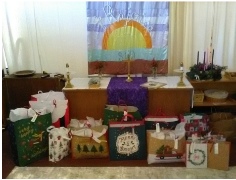
Gifts from St. Stephen's to children staying at the 40 Prado shelter

Wish lists were received for 15 children served by Operation Santa and 14 kids served by CAPSLO/40Prado. Parishioners brought toys and other gifts to Sunday morning services and put them in or around a basket at the back of the church. The donations were brought to the Children's Chapel where children in Sunday school said a prayer of blessing over them. Several parishioners donated money that was used at the end of the collection period to buy additional gifts to fill in the gaps.