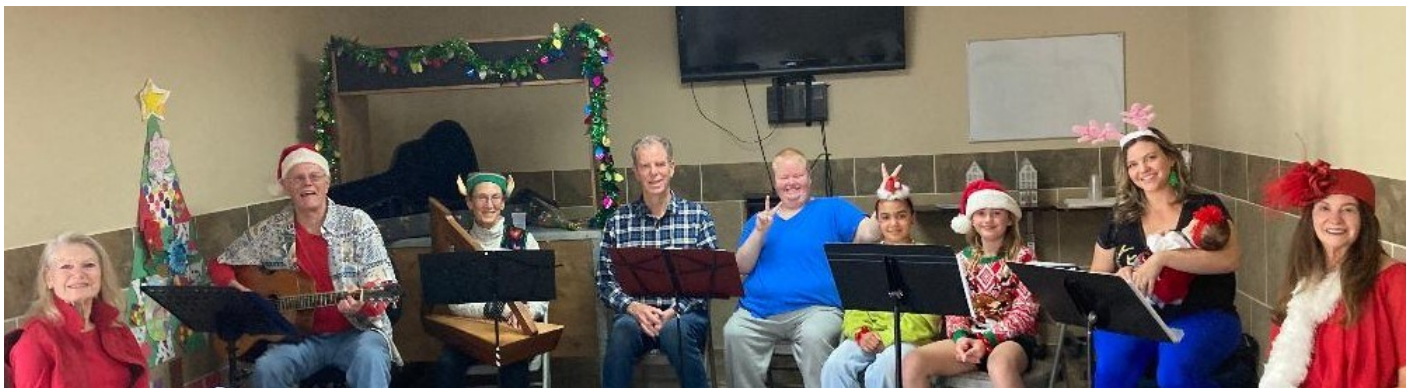
Caroling at Mission View Health Center

Thanks to your generosity we were able to provide baby toys, backpacks, Barbies, books, diapers, dinosaurs, games, gift cards, Hatchimals, Hello Kitty, Legos, a musical garbage truck, puzzles, Squishmallows, stuffed dogs & lions, super soft blankets and more to make Christmas 2024 a happier time for children in need in our community.