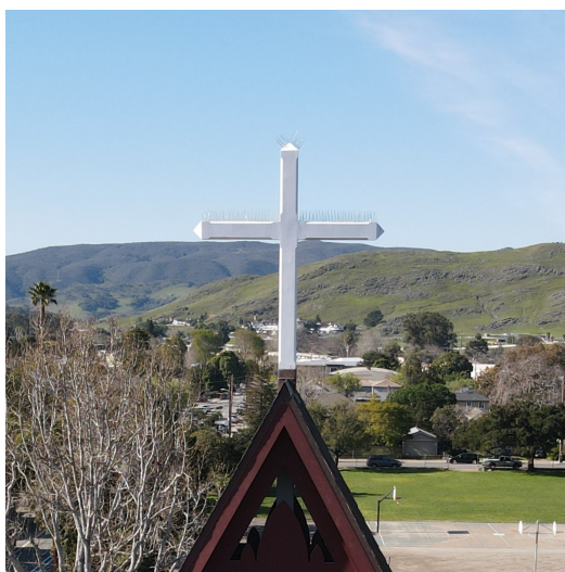
Probably the highest Cross in San Luis Obispo, the Cross on the St Stephen's Steeple, overlooking the southwest hills of the City.

dedicated on September 14, 335. Now the shrine is known as the Church of the Holy Sepulchre.