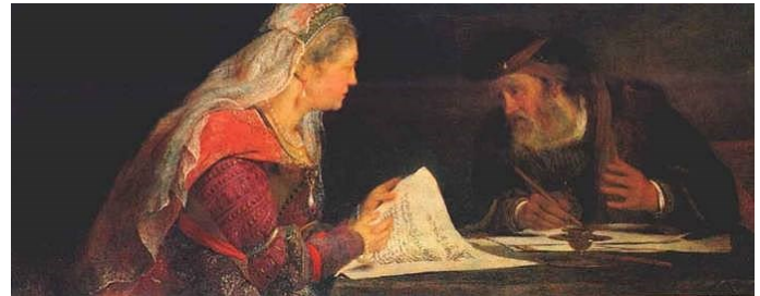
Esther and Mordecai writing the second letter of Purim (1685)