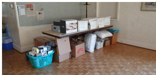
Welcome Home Boxes 2023

Purchase one or more items to go into a box or go together with friends or family to fill a whole box. Bring your Purchases to St. Stephen's on or before our St. Stephen's Day Celebration on September 8th.