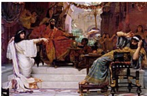
Esther Denouncing Haman (1888)