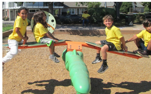
Fun at Emerson Park playground