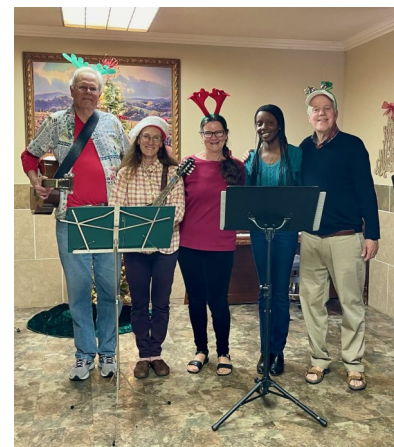
Caroling at Mission View Health Center

At Mission View most of the residents sang along and some staff stopped in for a few songs, too. At Sydney Creek one fellow seemed to know all the words to all the songs, one woman really enjoyed jingling bells, and everyone enjoyed exercising their lungs. At San Luis Post Acute there was a fellow celebrating his 99th birthday with his family visiting in his room. They asked us to come in to sing with him and we sang his favorite Christmas Carols with them.