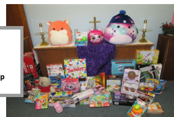
Operation Santa gifts before wrapping up

Thanks to your generosity we were able to provide toys, games, puzzles, baby toys, Barbies, Legos, a baby doll stroller, trucks, baby dolls, skateboards, art supplies, Squishmallows, playdough, slime, board games, gift cards and more to make Christmas 2023 a happier time for children in need in our community.