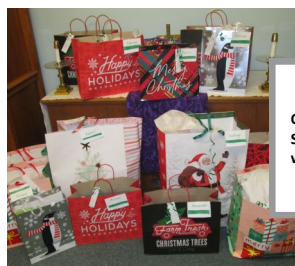
Operation Santa gifts wrapped

sorted and matched to wish lists then put into gift bags and brought to CAPSLO/40 Prado and Operation Santa.