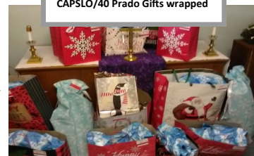
CAPSLO/40 Prado Gifts wrapped

Wish lists were received for 15 children served by Operation Santa and 16 kids served by CAPSLO/40Prado. Parishioners donated money or brought toys and other gifts to Sunday morning services to put in or around a basket at the back