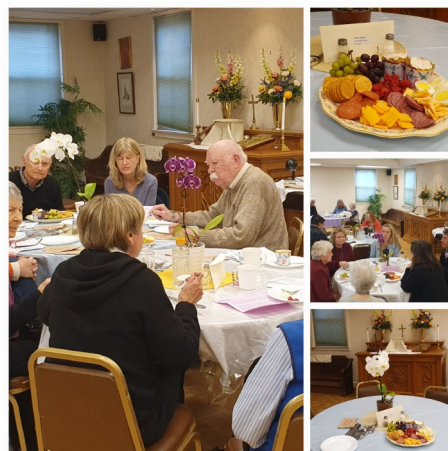
Images from the Eucharistic Brunch

Our Gospel for the 2nd Sunday of Easter in all 3 lectionary years is the one of Doubting Thomas. The full list of readings for Year A are Acts 2:14a,22-32 / 1 Peter 1:3-9 / Psalm 16 / John 20:19-31. The story of Doubting Thomas is a favorite of mine because it reassures me that I am still accepted by Jesus even if I have doubts. Even though I don't have a Doubting Thomas moment, that doesn't mean I don't fail to live up to my Baptismal Covenant! And the Doubting Thomas story reminds me that wherever I am on my spiritual journey, Jesus welcomes me.