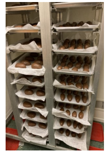
20 trays of no nut fudge centers ready to be coated in semi sweet chocolate.

At the time this article is being written the Chocolate Factory is in operation and orders are still coming in. There aren't any final totals yet, but we can report that it's likely we'll exceed last year's numbers and have all the donated eggs sponsored. Thank you to everyone who worked in the Chocolate Factory, ordered our chocolate Easter eggs, or made a donation toward the eggs to be given to children served by Family Care Network, CAPSLO/40Prado, Lumina Housing Services, and Transitions-Mental Health Family Services.